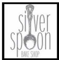
Silver Spoon Bake Shop